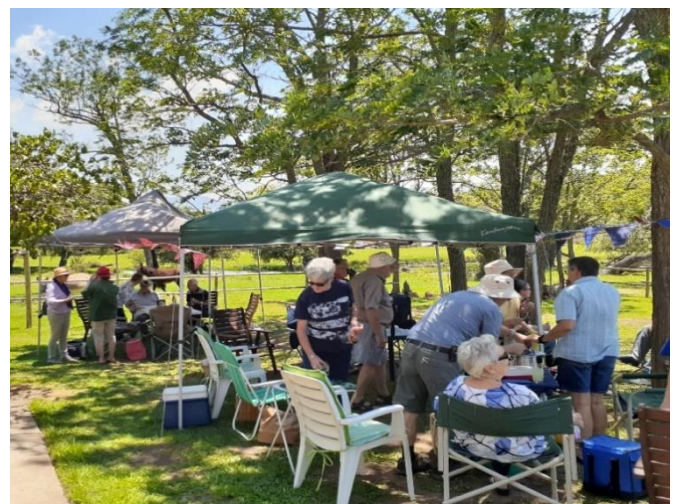
Avoiding the hot sun