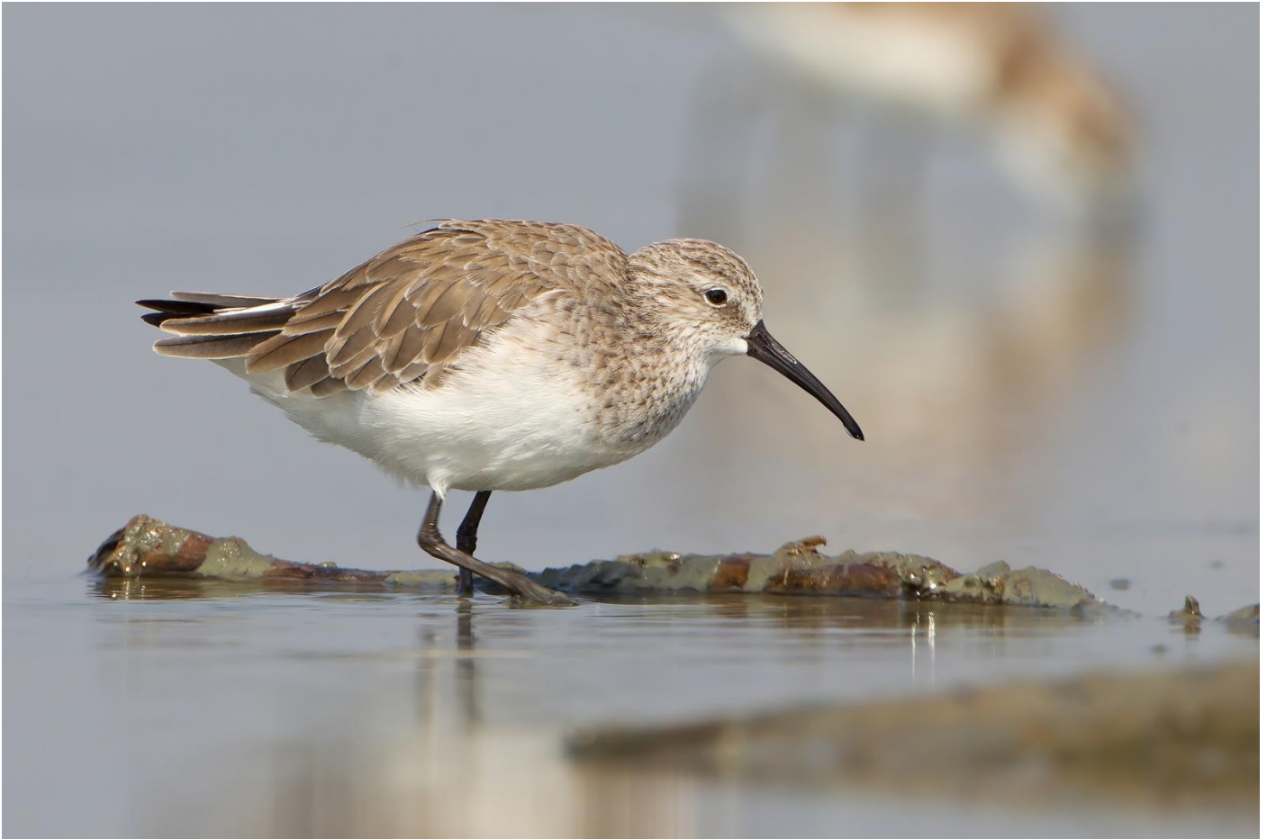
Curlew Sandpiper with its tell-tale curved bill.

29 September – a regular wetland watcher saw a group of three Curlew Sandpipers – a very nice record.