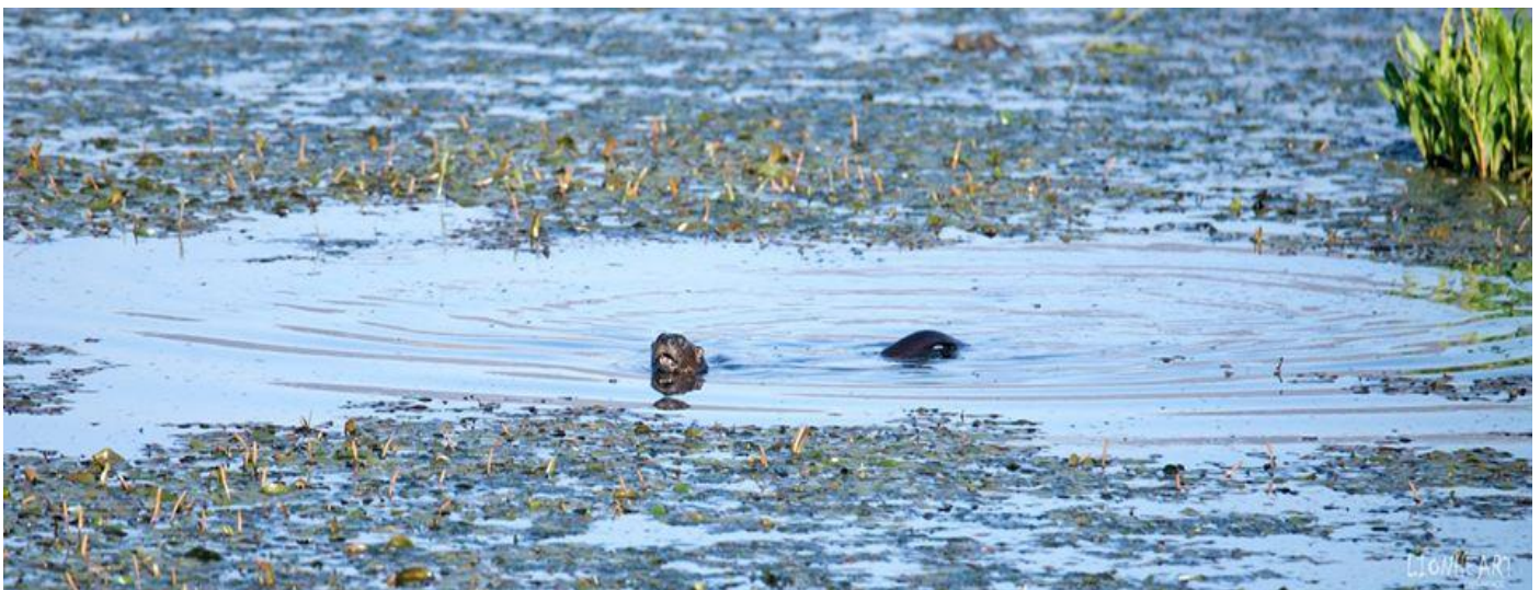
Spotted-necked Otter by Richard McKibbin, Wakkerstroom BioBash 2017

18 September – At the canal under the Amersfoort road bridge: OTTERS - Mother and child having a major rough and tumble in and out of the vegetation lining the bank (Oude Stasie side). Eventually they swam down the canal in to the main pan. I can only assume it was the same pair that came gambolling down the cleared break between the bridge and road, once again on the Oude Stasie side. They swam about rather playfully until the larger individual caught a large frog and began teasing the youngster, running up and down alongside the water's edge and all the while followed by the screaming youngster. The youngster didn't seem to find the situation at all funny! They finally disappeared from sight about 30 minutes after my original sighting – and then silence.