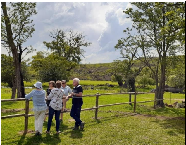
Peaceful surroundings at Hare's Rest