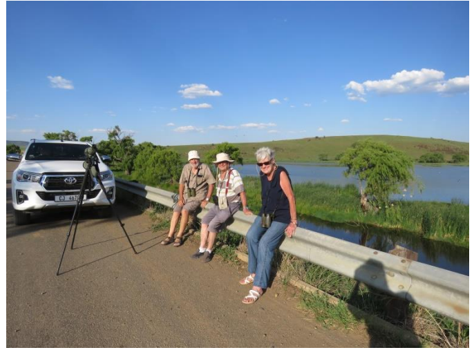
The Kana Thick-knees