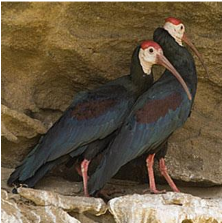
Southern Bald Ibis

Thanks to ROCKJUMPER BIRDING ADVENTURES for financial assistance, enabling us to carry out the Southern Bald Ibis monitoring programme in the Wakkerstroom area.